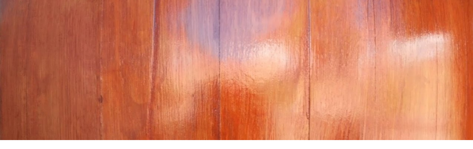
HERZOG Wine Cellars proudly supports the Ventura County Educators' Hall of Fame.